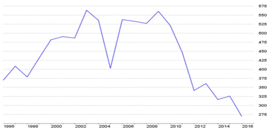
Figure 2. Evolution of the vegetative growth for Collado Villalba (Macroeconomic 2018).

Data, corresponding to 2018, shows that the foreigners, affiliated to the social security in the municipality of Collado Villalba, are 17,74% (12,84% Madrid region). The percentage of registered contracts in 2017 for EU foreigners was 7,17% (5,99% Madrid region), while for foreigners from other countries outside the EU it was 12,43% (11,82% Madrid region).