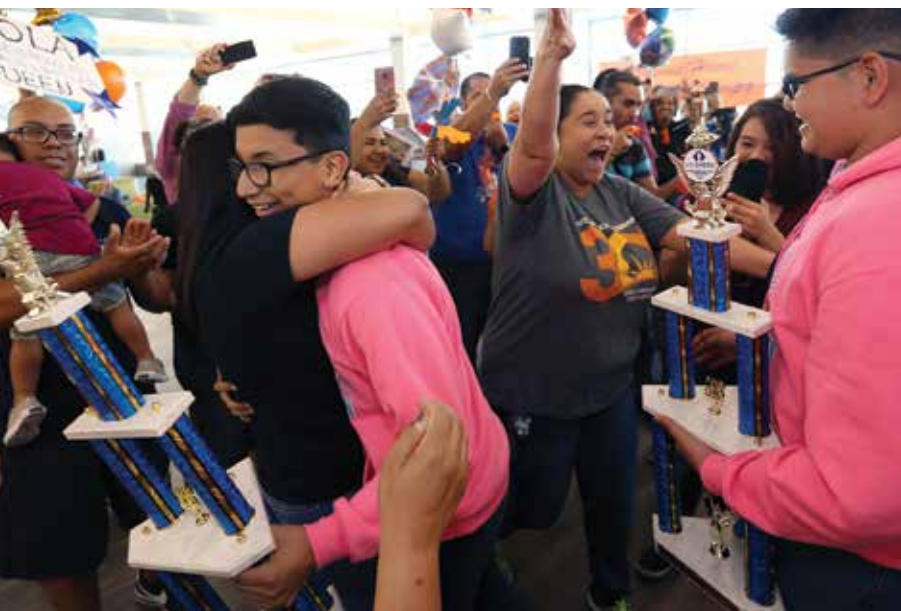
The Henderson Chess Team arrived home after winning yet another national championship.

The example of the Henderson Middle School chess team encourages all of us to avoid allowing past expectations to determine future outcomes.