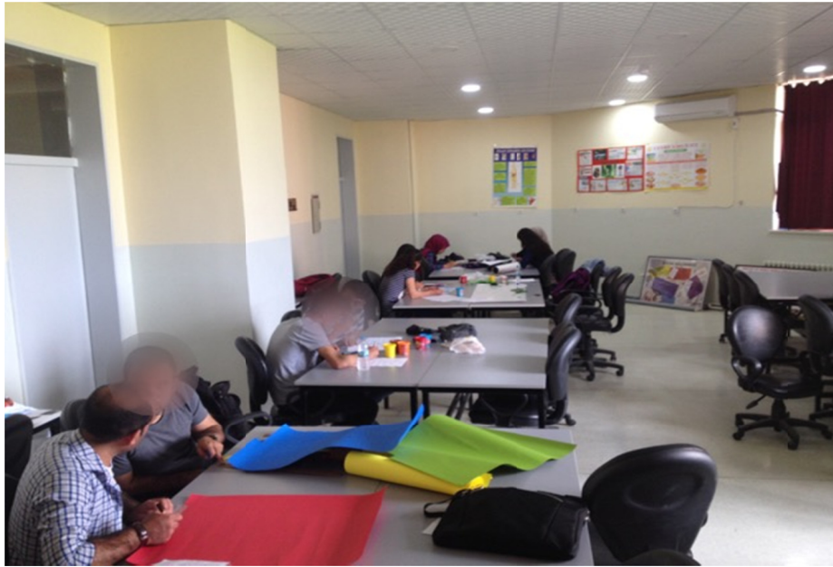
Figure 2. Application process

Digital photos: In this phase, the preservice teachers moved the models slowly and step by step which they formed with play dough and with other materials and took photos of these models.