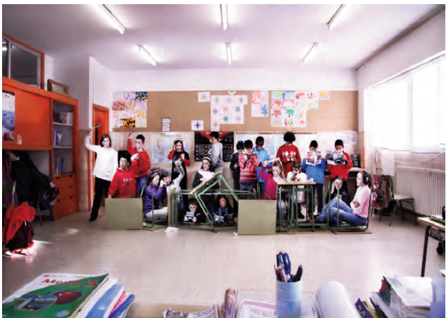
Figure 1. Photographs by contemporary artist Jesús Madriñán, students of the Faculty of Education and students of CEIP "Emilia Pardo Bazán" Primary School.