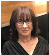
(✉ Corresponding Author)

MOOC courses in the fields of new media, entrepreneurship and innovation require pedagogical developers to create a clear and measureable peer assessment process of the innovative plans and projects developed by students. The objectives of our action research are to improve evaluations of students' plans and their innovativeness in a MOOC based on project-based learning (PBL). We analyzed 789 written peer assessments and grades of 89 PBL plans, which were submitted as part of the requirements in a new MOOC course 'New Media in Education' targeting student teachers. Correlations between final peer project grades and other assessment categories were calculated. A regression analysis model indicates that innovativeness and compatibility of student plans to educational needs are the strongest predictors final peer grades. Based on the research findings, we propose potential improvements in the peer assessment process, including additional guidelines for the assessment of innovativeness and other categories of PBL plans based on new media and digital pedagogy.