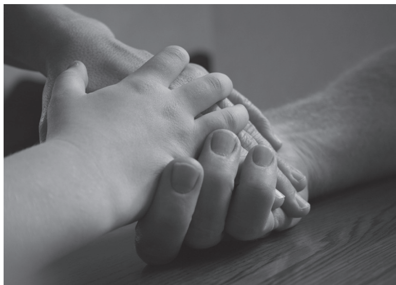
FIGURE 2. THE IMAGE FROM JOSHUA'S DIPTYCH

The images and reflections led to a recognition of the intersections of privilege and exclusion within our own classroom, breaking down what Yavneh