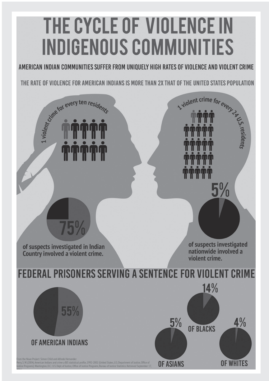
FIGURE 1. AN EXAMPLE OF A STUDENT INFOGRAPHIC

American juveniles in detention centers. His books Juvenile in Justice and Girls in Justice , explore the intersection of photography and sociological research as not only a powerful “catalyst for change” but a model of interdisciplinarity for our students. Ross’s work served as a springboard for an interdisciplinary