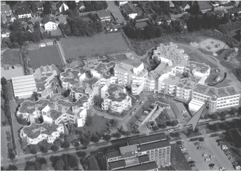
Aktion Sonnenschein, Kinderzentrum, Theodor Hellbrügge Foundation