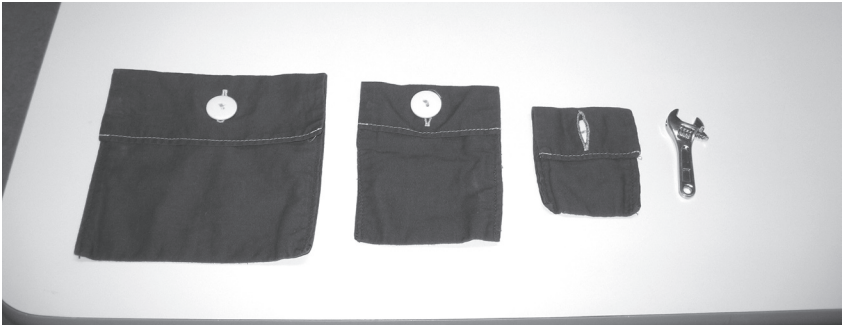
The Button Bag open.

This set of nesting button bags is high in visual contrast because it is made with white buttons, buttonholes, and dark fabric. Creating visual contrast is one adaptation to always consider for children experiencing vision deficits, problems with processing visual information, or problems with visual motor skills. Visual motor skills use both motor movements and vision in combination to successfully complete the skill. Buttoning, of course, is a good example of a visual motor skill.