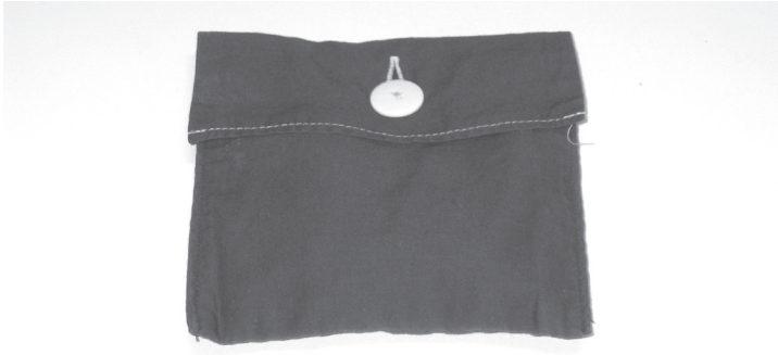
The Nesting Button Bag