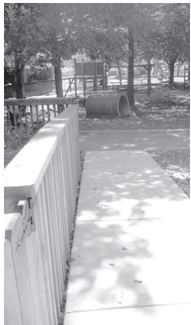
The asphalt path around the playground is accessible by ramps in 3 places.