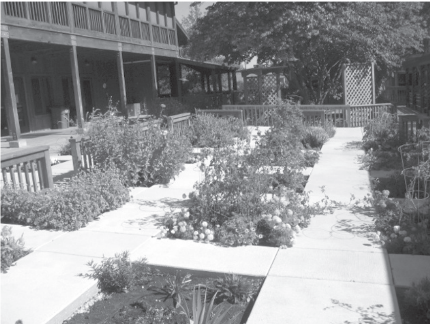
Pathways around the primary playground and through the primary gardens.