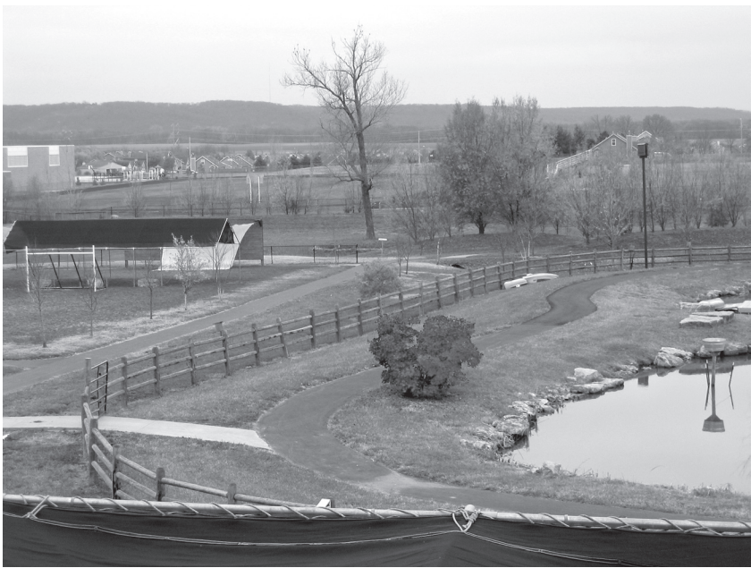
The asphalt path encircles the entire property creating connections throughout.