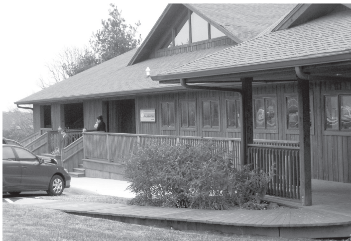
The ramp to Raintree’s front door.

An inclusive school uses ramps to create access for all.