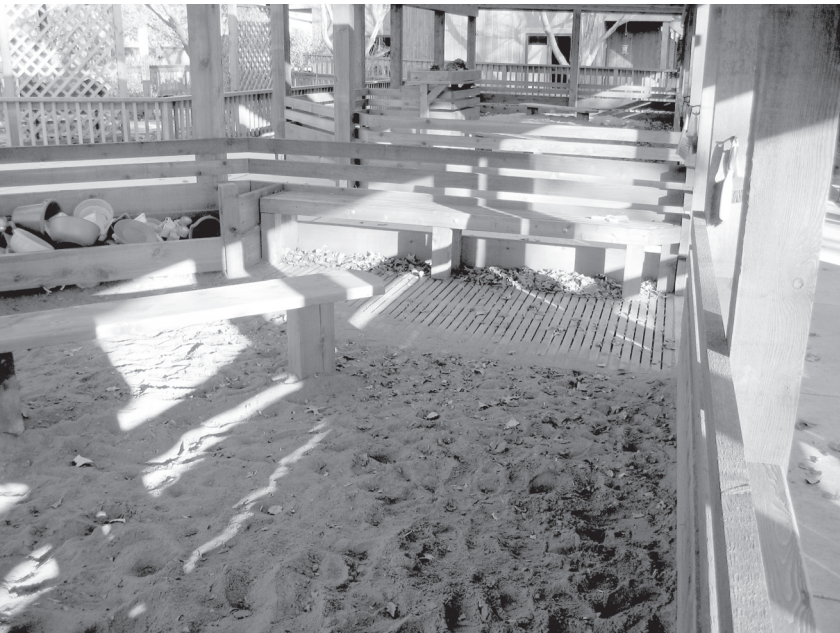
Wooden slats create an accessible path into the sand box.