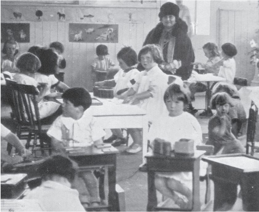
Dr. Maria Montessori observing at St. Otteran's School, Convent of Mercy, Waterford, 1927.

task and by breaking the whole task down into its concrete, smaller parts, all children could work purposefully towards their own self-construction. However, the Montessori method is not exclusively aimed at learning disabled children; rather, it is particularly suited for a variety of learners.