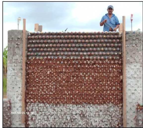
Figure 2 and 3. Building house out of plastic bottles in Honduras

In a mathematics lesson the teacher could first ask students to develop their own questions in relation to the situation in group work. Questions would then be collected on the blackboard and structured according to whether they can be answered with the help of mathematics or not. Afterwards students could decide for one question to answer, e.g. the question of how many plastic bottles are needed to build such a house. Students would then work in groups to investigate the problem and seek for solutions. Depending on how familiar the class is with IBL, assumptions could be first discussed in class or the students could continue directly in groups to estimate the number of bottles per row, the number of rows and so on. After calculating the number of bottles needed, they would communicate their solutions in class. Then, either in group or in class discussion students could reflect on the solution and validate it.