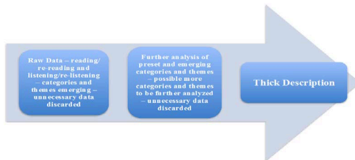
Figure 2: Data Analysis Process