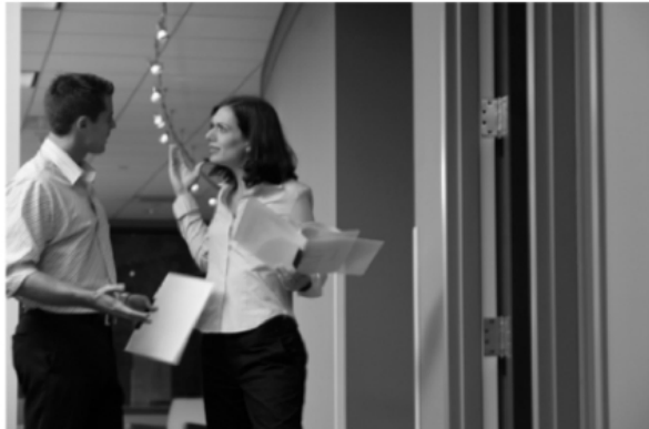
Figure 3. Excelsior OWL’s “Argumentative Essay” resource showing the use of stock photos to reinforce a resource’s main theme.

Argumentative essays are quite common in academic writing and are often an important part of writing in all disciplines. You may be asked to take a stand on a social issue in your introduction to writing course, but you could also be asked to take a stand on an issue related to health care in your nursing courses or make a case for solving a local environmental problem in your biology class. And, since argument is such a common essay assignment, it’s important to be aware of some basic elements of a good argumentative essay.