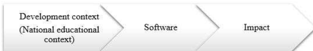
Figure 1. Monitoring and evaluation discussion framework adapted from Wagner, Day, James, Kozma, Miller & Unwin, (2005).

Based on the core elements highlighted by Kozma and Wagner (2005), the Duolingo-Colombian government partnership in the project 40.000 Primeros Empleos is analysed. Furthermore, the discussion considers ICT in a conceptual education framework as proposed by Wagner, Day, James, Kozma, Miller & Unwin, (2005). The adaptation of this framework is presented in figure 1.