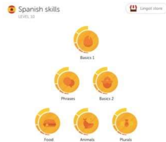
Figure 3. Duolingo language tree.

Having said this, a user who accesses Duolingo is likely to perceive the educational outlook of the platform. Duolingo presents a language skill tree that is to be discovered through gamified language exercises. It offers a considerable degree of personalized language learning through elements that promote self-directed study and engagement through motivational features. Furthermore, in 2015 Duolingo launched Duolingo for Schools , a free dashboard which offers educators the possibility of integrating Duolingo into their language instruction. Teachers can see and use the complete language curriculum provided by Duolingo, and they can also assign homework and track the activity of students in the app. Figures 3 and 4 show the educational outlook of Duolingo.