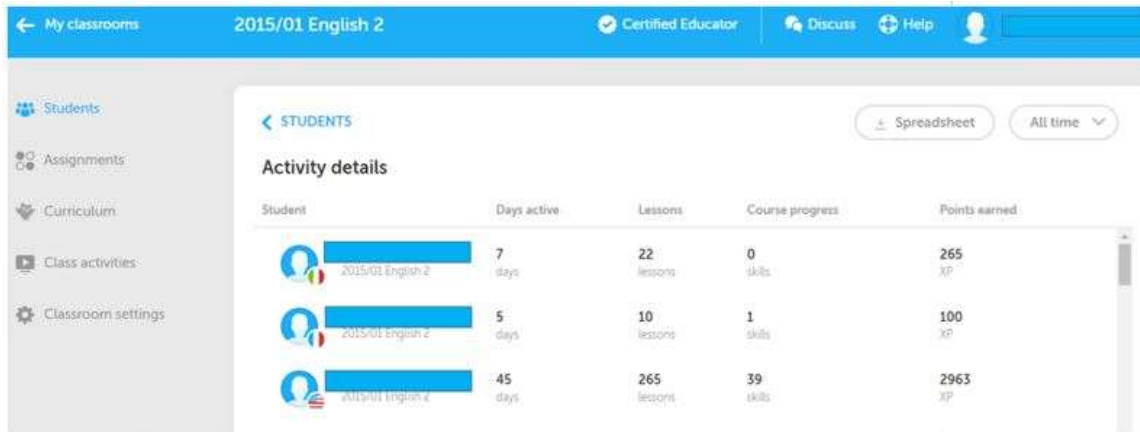
Figure 4. Duolingo for schools dashboard.