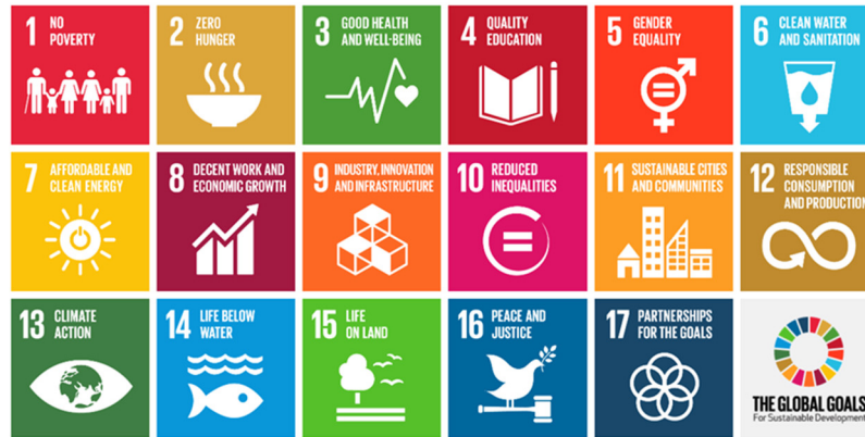
Figure 1. Seventeen (17) Sustainable Development Goals (SDGs)

Within these goals, seventeen aspects of sustainability are emphasised: elimination of poverty, elimination of hunger, health and wellbeing, quality education, gender equality, clean water and hygiene, clean and affordable energy, economic growth and good employment, innovative infrastructure and industry, inequality, sustainable cities and communities, sustainable consumption and production, sustainable production, climate change and disaster risk reduction, marine ecosystems, land ecosystems, peace and justice, and partnerships for development (Figure 1).