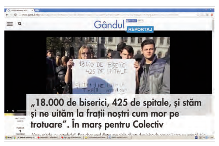
Figure 2. The most viewed article concerning the #Colectiv tragedy on social media [18,000 churches, 425 hospitals, and we watch our brothers die on pavements. Marching for Colectiv].

An analysis of the most popular articles on the adevarul.ro site between 11-30 November reveals that no article concerning the Colectiv fire or its consequences figures among the top 30, according to the search engine. However, on 28 November we spotted materials