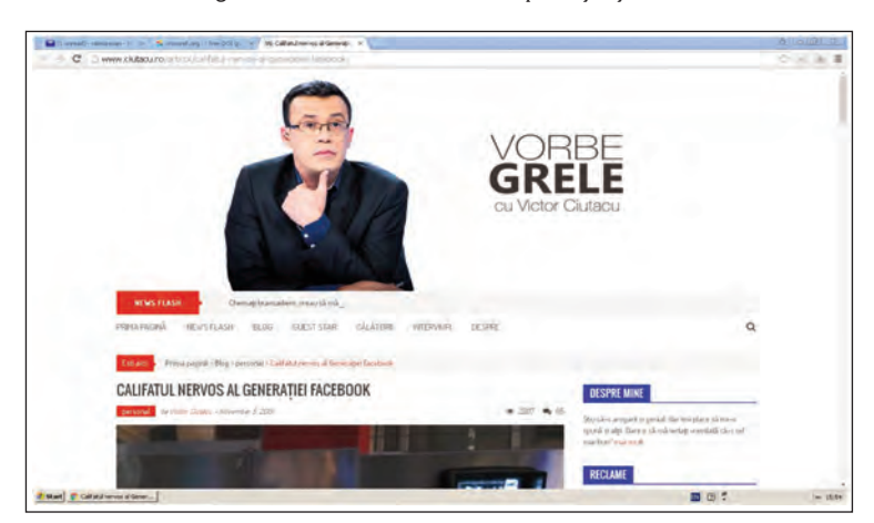
Figure 4. One of the most viewed postings of an influencer from Romania. ["The angry caliphate of the Facebook generation" Harsh Words' blog by Victor Ciutacu].

On the adevarul.ro site, the articles enjoying the greatest popularity during the month following the tragedy were of the non-