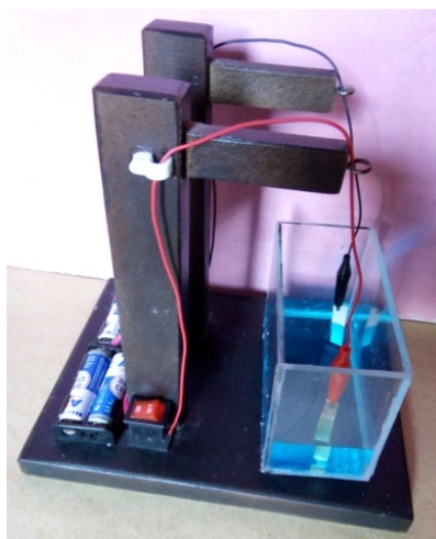
Figure 3. Electroplating Tool

Electroplating tool shows a simple electroplating process in Kotagede, in silver handicraft industry. The principle of electroplating is that the coated metal treated as a cathode which connected with a negative pole and the coating metal treated as anode which connected with the positive pole.