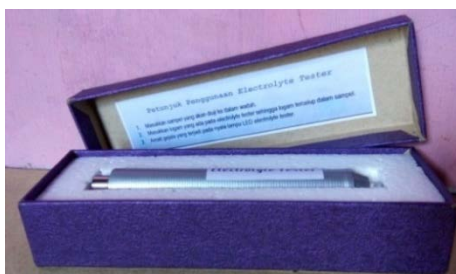
Figure 2. Electrolyte Tester

Electrolyte tester is a tool which helps to test whether a solution can conduct electricity or not. The solutions can be tested using an electrolyte tester; one of which is a solution used in the process of electroplating. The silver handicraft industry in Kotagede, Yogyakarta, uses electrolyte solutions which contains gilding metals so that the electroplating process can be done [13]. Electrolyte tester can be seen in Figure 2.