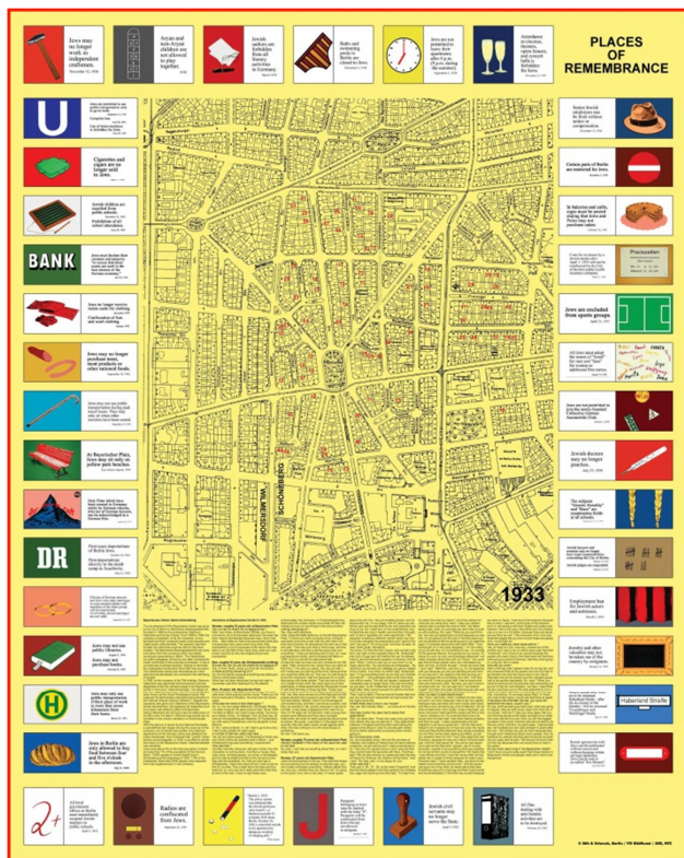
(c) Stih & Schnock, Berlin / VG Bild-Kunst, Bonn / ARS, NYC

The students were sorting through the materials, discussing the decrees, the emerging timeline towards deportation and murder displayed by the dates specified in the texts. The following assignment was used to organize this task: