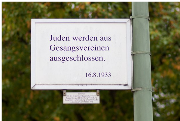
The inscription back reads (translated): „Jews are banned from choral societies. 16.8.1933“.