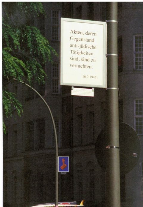
The inscription back reads (translated): „Files covering anti-Jewish activities are to be destroyed. 16.02.1945

Linking these perspectives allows to extend the concept of agency, focusing on the independent examination of historical and political narratives (cf. KMK, 2014) and the ability to take part in their constant and contested rewriting.