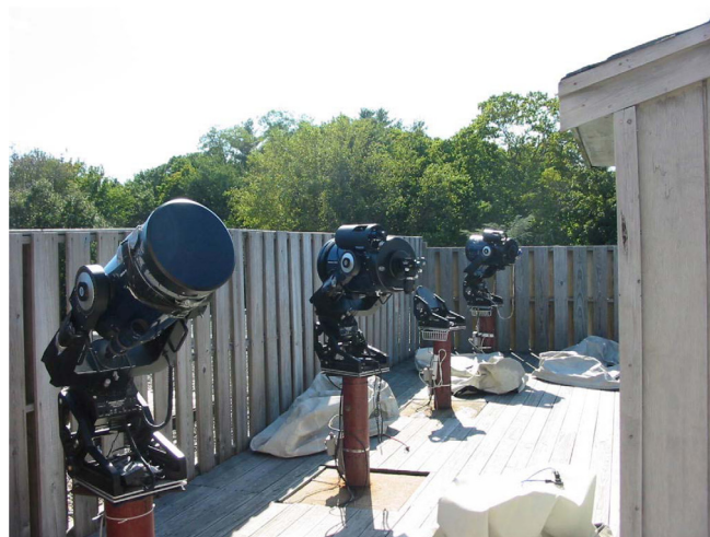
FIGURE 2: (Color online) Campus observatories can enable memorable hands-on, eyes-on learning experiences for college students enrolled in introductory astronomy courses. The observing facilities can consist of (top) classic domed structures housing one or more telescopes and/or (bottom) more distributed telescopic facilities without an enclosure—the latter enabling modest initial investment.