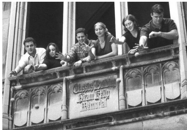
FIGURE 1: Getting students to take a more active role in their own learning is a key attribute of recent astronomy education reform efforts. For example, this student-initiated re-enactment of Galileo’s experiment with falling objects was prompted by a conceptual “challenge” by the instructor which had the students actively predicting, explaining, and deliberating over what would happen (see http://casa.colorado.edu/%7Edduncan/challenge.html).