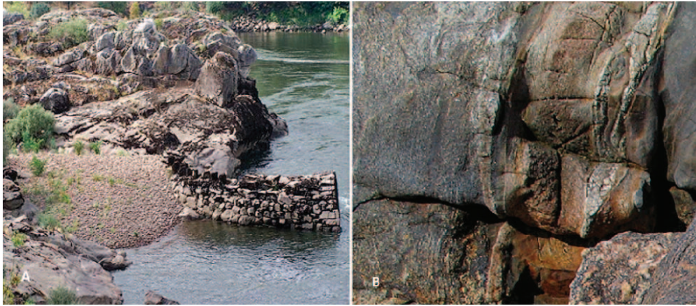
FIGURE 1: (A) The banks of the Minho River with alluviums associated with fishing artifacts. (B) Outcrop showing the diversity of igneous and metamorphic lithologies and textures.

The scoring classes took into account the minimum and maximum values of each subscale and were calculated according to the respective number of items. The interval range for each subscale was distributed within the five classes, each establishing its own limits. For example: the scale has seven items; considering the minimum (1) and maximum scores (5), the interval of scale seven is set between 7 and 35. Accordingly, the limits determined for each class were as follows: I (7–13), II (14–18), III (19–24), IV (25–29), and V (30–35).