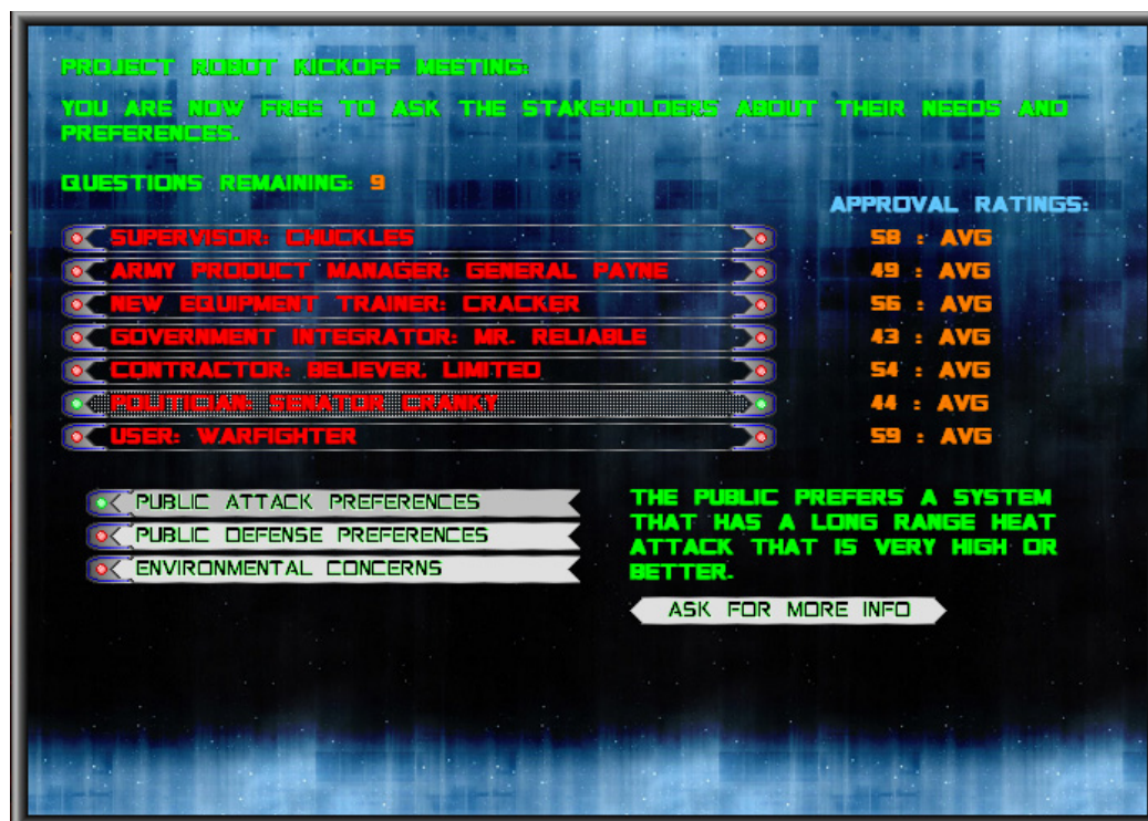
Figure 1: Stakeholder Question Screen

This set of stakeholders is simplified, but consistent with typical defense projects. The player has the opportunity to ask a limited number of questions (Figure 1) to these stakeholders to determine their needs and preference, and then spend a limited amount of resources to choose and refine different components, sub-systems, and attributes of the giant robot (Figure 2) in order to satisfy these preferences and ultimately field a product that fulfills its purpose.