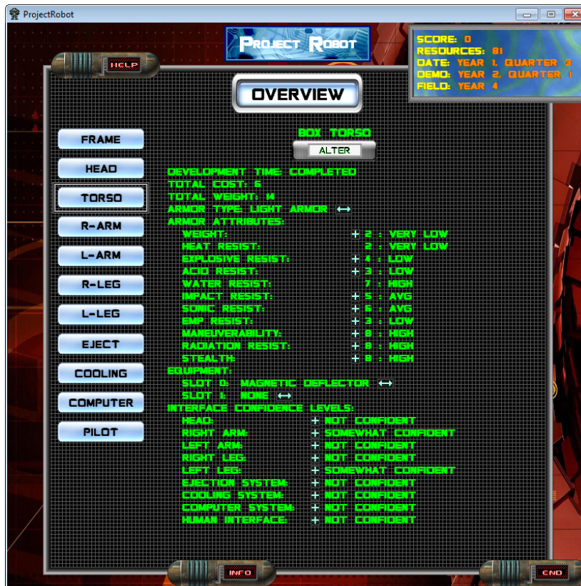
Figure 2: Robot Attributes Screen

The player is able to manipulate the robot's design through interaction with the overview screen (Figure 3) and other related screens. The overview screen shows the overall system specifications and attributes according to its current design, and allows the player to select different parts of the robot to enhance, change, or build.