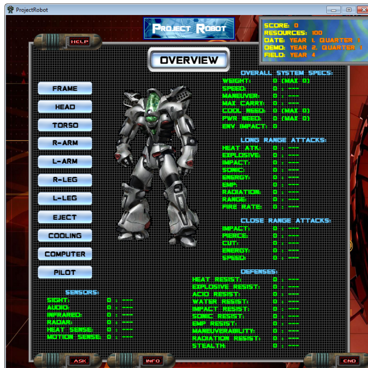
Figure 3: Project Robot Overview Screen

The player is able to manipulate the robot's design through interaction with the overview screen (Figure 3) and other related screens. The overview screen shows the overall system specifications and attributes according to its current design, and allows the player to select different parts of the robot to enhance, change, or build.