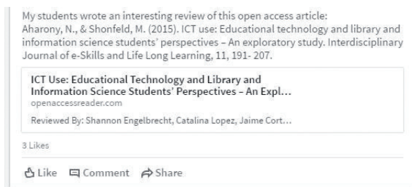
Figure 4: Faculty share of a student group's blog posting on LinkedIn

After the second iteration, we began highlighting student blog postings via LinkedIn (see figure 4). There was positive reception from LinkedIn connections to the student contributions.