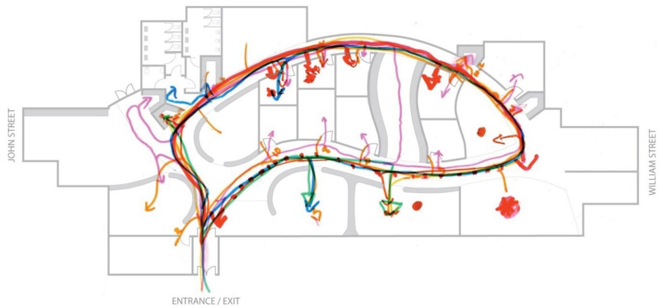
Figure 3. Overlaid visual maps.

becoming clear very quickly. The process also prompted a great deal of discussion about the limitations of the space in peak hours, when preferred spaces were not available, and the degree of social engagement in the space. This flagged a pattern of use that was opportunistic (looking for friends) and indicated that the Hub had become a focus of campus visits, something that was not evident in the diamond ranking groups.