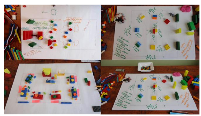
Figure 4. Examples of environments designed by focus group participants.

activity, despite the scheduling challenges involved. The feeling of time constraint may also explain why participants tended to use very basic forms of representation. Most groups used mostly blocks, marker pens, and pipe cleaners, making use of annotation to explain what was being represented (see Figure 4).