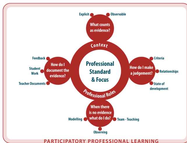
Figure 1: The Participatory Professional Learning Model

The original Project Evidence team conceptualised and developed what they referred to as a Participatory Professional Learning (PPL) model (Figure 1), acknowledging the role of shared learning and joint construction involved in learning what it means to teach within a “collegial learning relationship instead of an expert, hierarchical one-way view” (Le Cornu & Ewing, 2008, p. 1803).