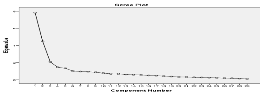
Figure 2. Scree Plot

When examining Table 3, it can be seen that there were five factors with an eigenvalue bigger than 1.00. The first factor described 27% of the total variance. The contribution of the factors of the total variance percentage decreased after the first factor. This situation can be seen in Figure 2.