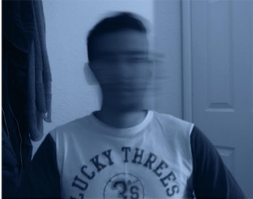
Figure 1. Caught in motion, Photography, Luke Willoughby, 2015

Figure 1 shares Luke's exploration of identity and perception through photography. As with the moving image, changemakers are perceived in different ways as situations and problems around them change and unfold. Caught in motion plays with this. The image lacks clarity in facial expression. The emotion portrayed is difficult to perceive. The object's focal point is unclear, as is the identity and thought of the character. The t-shirt's slogan emphasises probability, and probability as a concept suggests multiple possibilities. Changemakers look for multiple solutions in order to make a positive impact choosing a strategy for the addressed challenge. These inferences may be challenging to read, yet where cognitive progression is concerned it does not matter if these components are not immediately accessible because the image provided the artist teacher a visual voice (Heaton, 2014a). Art has a transformative power to alter social perception (Wehbi, McCormick & Angelucci, 2016), which can be true for viewer or artist. In this case it is artist cognition influenced by changemaker principles that is being developed through engagement in art practice. Our artist teachers experiment with changemaker ideals through research and making. They identify problems to be explored and forge potential solutions. This, in turn, develops their awareness of social justice art education.