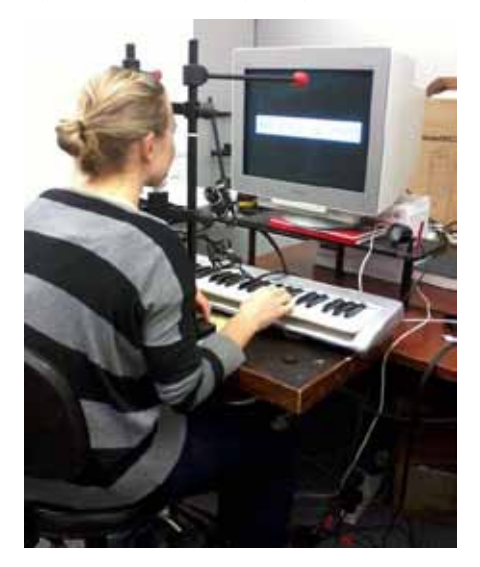
Figure 2: Experimental set-up showing piano keyboard, computer display and eye tracker camera

The location of T1 and T2 was determined using Fleximusic<sup>™</sup> Audio Editor. The sound files were imported and the points on the wave file for T1 and T2 were determined by first filtering for noise and then manually marking the location of T1 and T2. This process was found to be repeatable to within 0.05 second. Once T1 and T2 were known in relation to the length of the sound file,