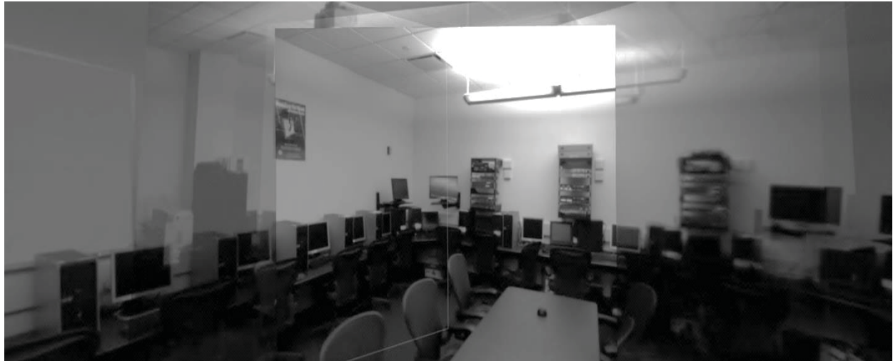
Figure 1. The CIS Lab, prior to renovation.