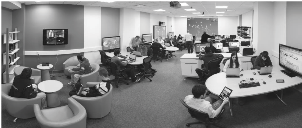
Figure 2. The renovated CIS Learning and Technology Sandbox.