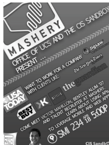
Figure 1. Students create posters and flyers for special events in the CIS Sandbox.