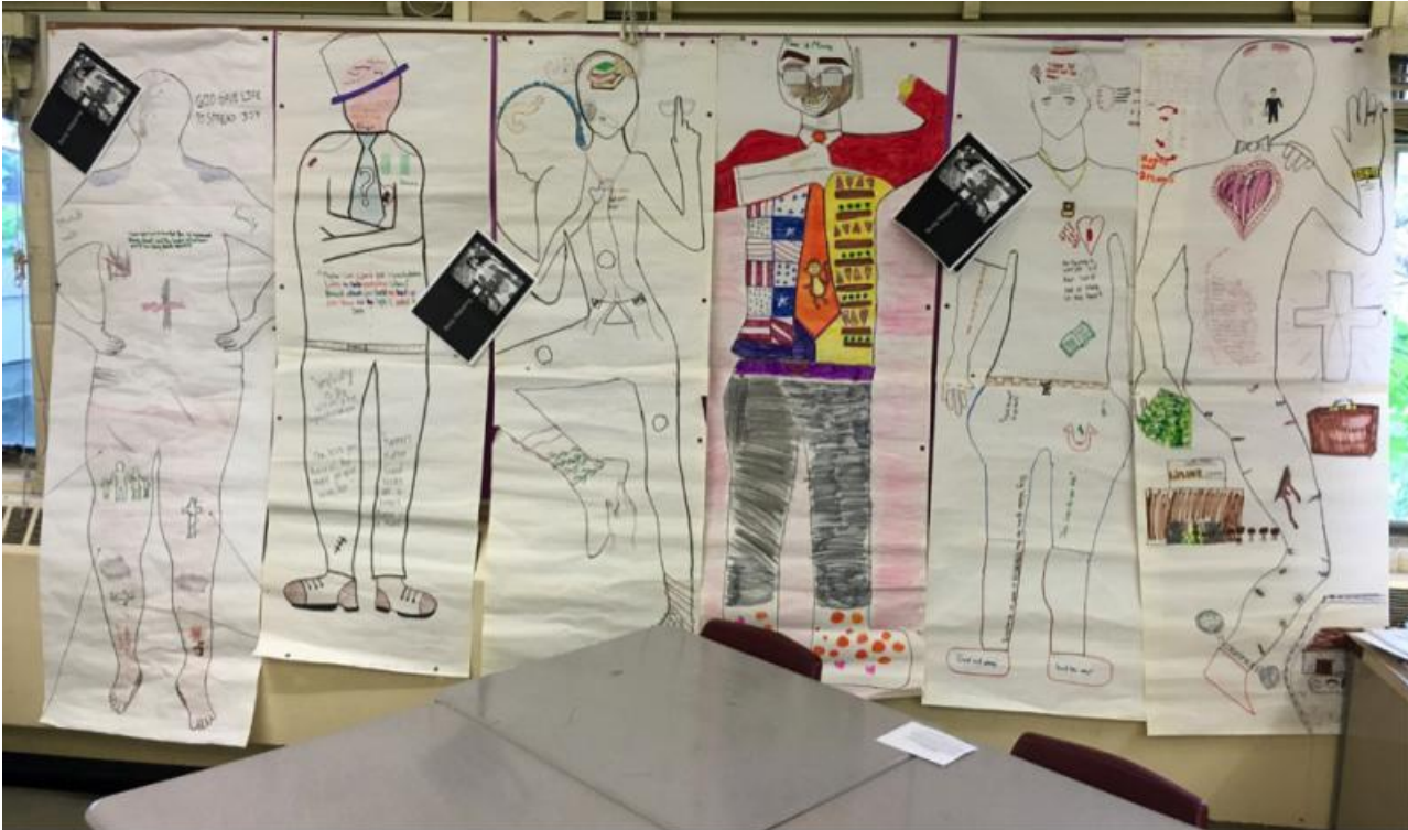
Figure 1: Completed Body Maps

Body Mapping is a narrative-based inquiry method that was developed in Tanzania, Zambia, and Canada by a Canadian AIDS service organization to help in counselling and documenting the narratives of HIV-positive women in Africa (CATIE, 2007). Through Body Maps, students created visual interpretations of characters' experiences with discrimination based on race, gender, age, and socio-economic status. My collaborating teacher and I then conferenced with students to discuss what symbols students chose to use to interpret their assigned characters' onto Body Maps, and to go over what connections they made between their characters' lived experiences, and the ways that these issues manifest in society today. The Body Maps acted as an initial tool to help students become critically conscious of the characters' experiences with discrimination by mapping them out using symbols.