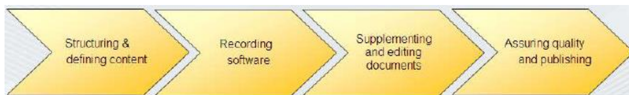
Figure 1. The process to develop a TTKF online training material (TT Knowledge Force, 2015)

In order to develop the e-Learning solution a process has been defined which is presented in Figure 1.