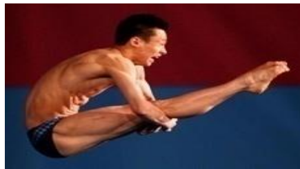
Figure 2. A swimmer diving

Q2: As seen in Figure 2, sportsmen or swimmers who jump off a high platform pull their legs towards themselves when they want to roll in the air. Please explain the reason of this behavior.