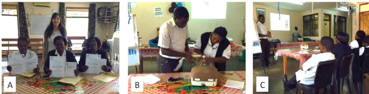
Figure 1. Visiting physician and candidates with their course certificates (A), local clinical officer teaching a candidate bag-valve-mask ventilation (B), candidates attending a lecture delivered by the clinical officer (C).

The clinical officer observed the initial sessions before delivering teaching sessions under observation and then independently with the goal that this individual would then be equipped to train more nurses in the future and continue to run the course on an annual basis.