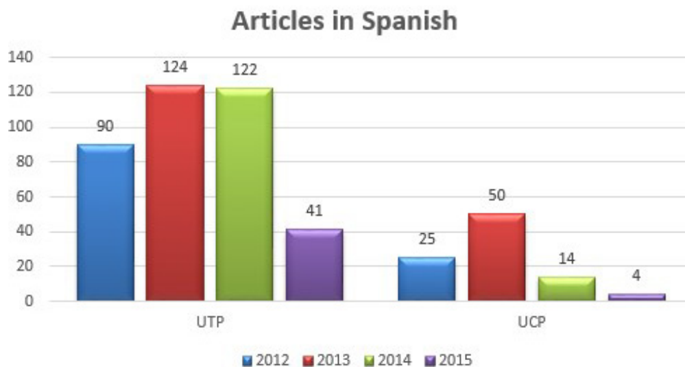
Figure 2. The amount of the articles written in Spanish by the professors of two institutions during last 4 years (CIARP Universidad Tecnológica de Pereira, 2016) (Dirección de Investigaciones e Innovación, Universidad Católica de Pereira, 2016)

‘Colombia Bilingüe’ is an ambitious project of the Colombian government and its Ministry of Education to increase the English proficiency of primary and high school students (‘Lenguas Extranjeras’, 2017). As part of its future consequences from 2018 and on, English courses will be mandatory in higher education institutions to obtain the ‘Registro Calificado’ (Qualified Registration) which checks and ensures quality conditions in the academic programs of undergraduate programs in Colombia (‘¿Qué es el Registro Calificado? - Sistemas