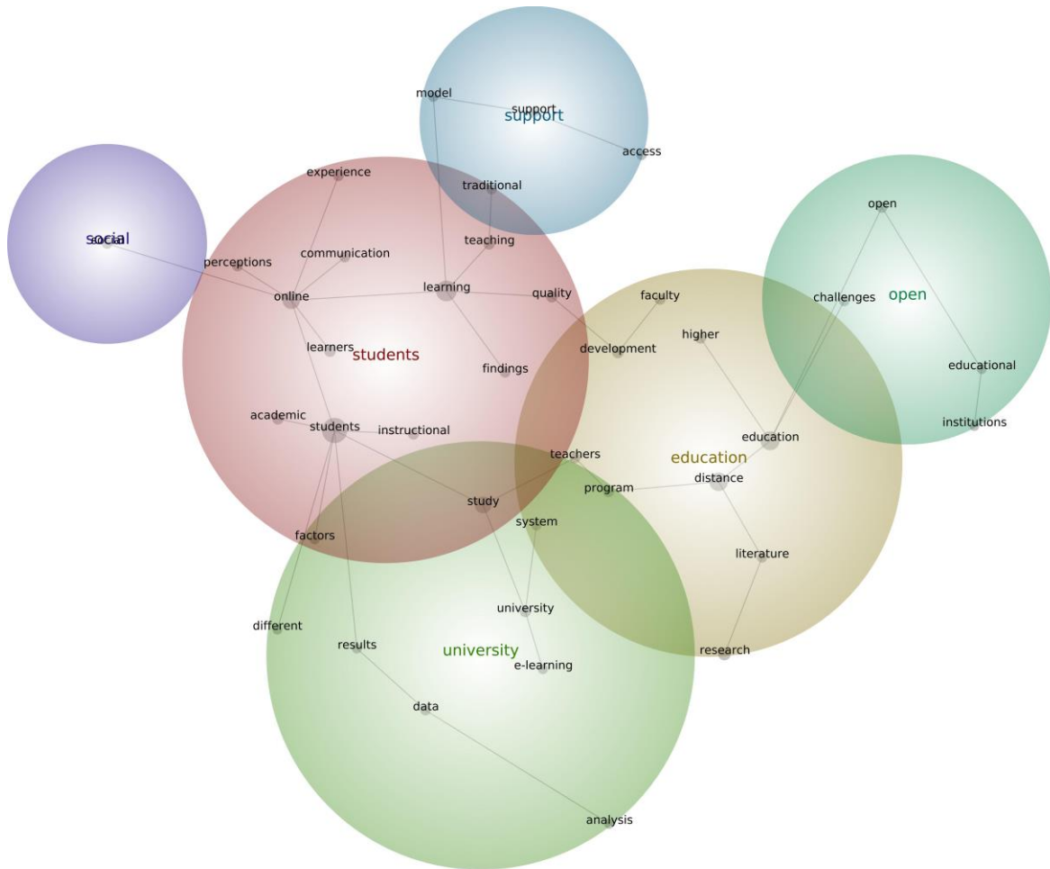
Figure 3. Concept map of widening access to education and online learning support (2006–2010).

Around this time the issue of access to educational opportunities and open education came to the fore, moving up from the eighth to the third rank of research areas covered in the publications (see research area of “access, equity, and ethics” in Table 5). Four special issues deal with all kinds of aspects related to openness and open education: Open and Distance Education in Asia (2007), The Role of Distance Learning in the Right to Education (2008), Open and Distance Learning in Africa (2009), and Openness and the Future of Higher Education (2009). Papers in this thematic context explore the emergence of open-source software, course management systems, in particular, in North America (Pan & Bonk, 2007), the role of using ICTs and open and distance learning in increasing access, equity, and quality of rural teachers professional development in China or the potential of open access to reduce the high costs of textbooks at American universities (Baker, Thierstein, Fletcher, Kaur, & Emmons, 2009). Fini (2009) published the first paper in IRRODL about the evaluation of a MOOC, the famous Connectivism and Connective Knowledge (CCK08) course.