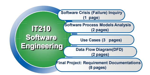
Figure 1 IT210 Writing Assignments

In the course, students are evaluated on the basis of four writing assignments and a comprehensive written project. All the writing assignments are designed to emphasize as well as improve students' writing skills, critical thinking, team communication skills, and professionalism. The four writing assignments and the project involve selection of particular techniques to solve specific problems in the software engineering field. For each, students need to submit a draft document in compliance with the documentation standards dictated by the instructor. All the drafts must be received by the instructor on the due date and the final versions of the assignments are not graded if students do not submit the drafts on time. The draft documents are reviewed by the instructor and by other students in the class. Students must use comments from this review process to prepare the final documentation. The following figure shows the assignments title and length requirements.