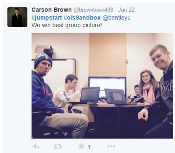
Figure 3. Tweeting a group photo after the JumpStart session.

3, that one student Tweeted during their session.