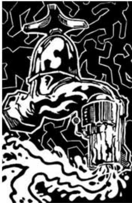
Figure 2 Student (B) Untitled Linocut print. Size A4. 2006

material wealth and discriminatory treatment by society. His journey to and from the university was educational, in the sense that he became aware of the lack of human rights practice among the people who mattered. In his first graphic print based on Article Twenty Four of the Bill of Rights, that is, 'Environment' (Republic of South Africa, 1996:24), Student A explained that this image was as much about social inequity as it was about the environment. In his print (Figure 1), the symbolism is two-fold; firstly, the upper composition depicts the environmental effects of industrialization and globalization, that is, the way in which technological advances in industry and global communications pay scant regard to their effect on the environment. The image addresses the danger of rampant pollution in a fragile natural world, symbolized by the brittleness of an animated tree. Student A juxtaposes technology with poverty symbolized by the group of urban dwellers, which he based in the township of Soweto. The composition addresses the sharp distinction between the level of historical disenfranchisement that contrasts an image of urban poor people against the economic advantage of a growing technology and communications sector.