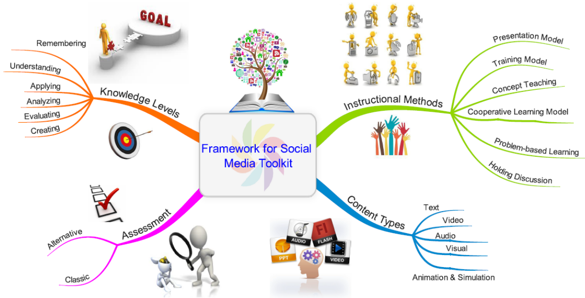
Figure 1. Framework for the Social Media Toolkit.

Instructional methods. Six well-known approaches to teaching (Presentation Model, Training Model, Concept Teaching, Cooperative Learning Model, Problem-Based Learning, Holding Discussion), three of which are teacher-centered and three student-centered, were the instructional methods selected due to their common usage (Arends, 2011; Borich, 2013; Burden & Byrd, 2013).