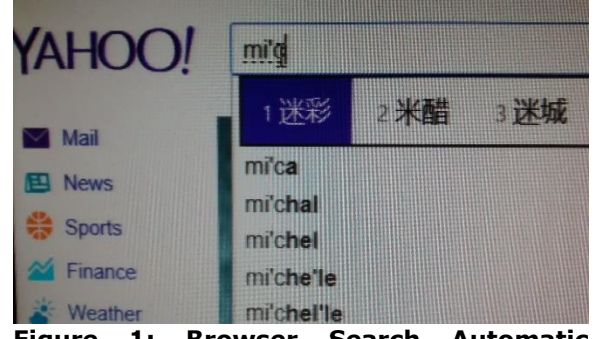
Figure 1: Browser Search Automatic Chinese Translation

attempting to assist students with problems, particularly error messages. Ideally, all students would use the English version but some students really struggled with English and were more comfortable using the Chinese version. As such, we did not require them to use the English version. Obviously, the icons are the same and if you are familiar with the software it is possible to navigate fairly well with some translation assistance from the students. Even the English version of the software would frequently try to translate what was being typed making modifications to Chinese, to PowerPoints on the fly and web searches challenging (see Figure 1). The automatic translation adds single quotes as you type and translates to Chinese characters.