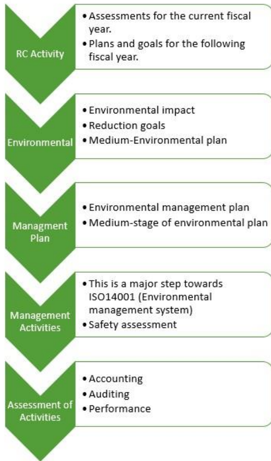
Figure 2: Responsible Care Implementation Process( https://responsiblecare.americanchemistry.com/Responsible-Care-Program-Elements/Management-System-and-Certification )

The Responsible Care Organization audits and trains petrochemical companies on how to handle their products in a way that reduces the number of safety incidences, while simultaneously increasing efficiency. Prior to training, all segments of the company go through a vigorous safety and quality audit and all issues uncovered during the audit must be remedied. RC requirements were extended to cover contracts handled by third party vendors, and now require comprehensive audits of their facilities. The method for handling contracts under RC differs greatly from SAPCO's current practices.