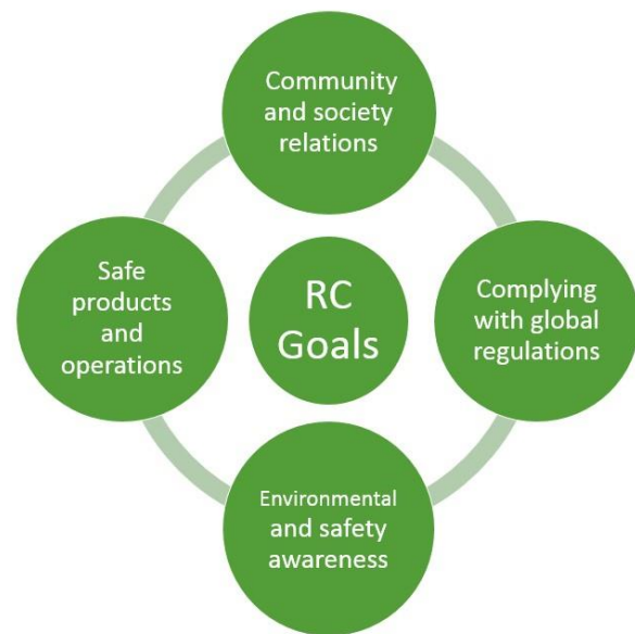
Figure 1: Goals of Responsible Care Association ( https://slideshare.net/kaushalsutaria/rcms-rc-14001 )

In an effort to maintain their industry leading position, SAPCO began to research ways in which they could differentiate themselves from other organizations in the market. They were approached by the Responsible Care Association (RC), a United States based safety organization overseen by the American Chemistry Council (ACC). The goals of the Responsible Care Association can be seen in Figure 1.