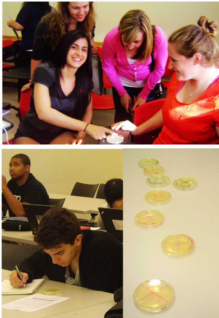
Figure 2. Student Engagement. Top: Students performing the alcohol wipe experiment; Bottom: Students observing colony morphology during the second classroom period