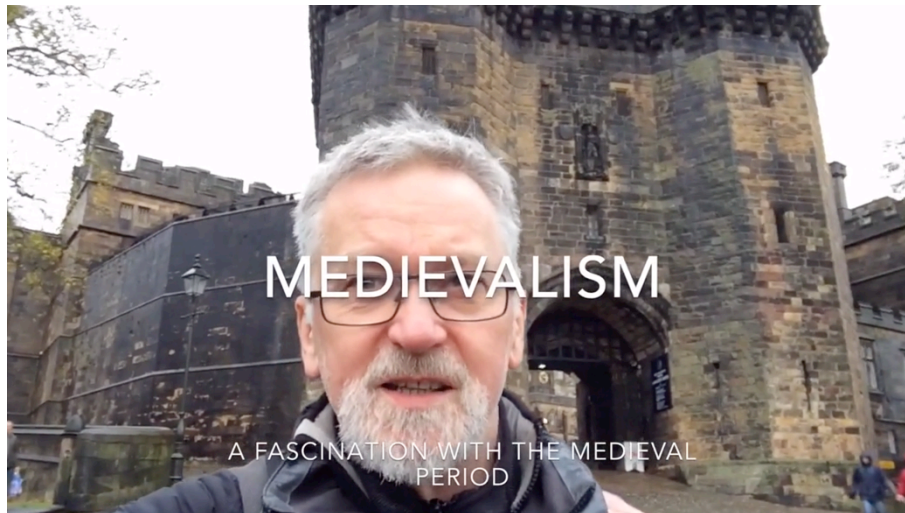
Figure 1. A screen snapshot from a recorded lecture about romanticism in digital cultures (recorded in Lancaster, England).

styles. None of this involved professional studio recording, professional producers or editors, or specially equipped lecture capture teaching rooms. We were keen that the digital lecture delivery continued the practice of according independence to the self-reliant lecturer. This meant that we could change and adapt course content on the fly in response to changes in subject matter and responses from students. In the second year of the course we re-recorded certain segments and uploaded these to the video server.