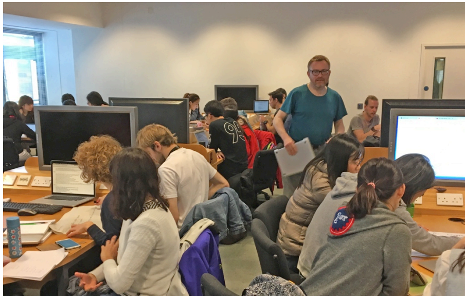
Figure 3. The class learning space.

In the first session, we divided the class into groups of 12 and gave each group a name according to the International Radiotelephony Spelling Alphabet, viz., Alpha, Bravo, Charlie and so on. This fitted the initial post-digital theme which also encouraged us to commission each group to move outside the classroom to gather video evidence on how people live with and without digital technology and to upload these short videos to YouTube . They were then to discuss these in their groups: Is there really anything in the world untouched by digital technology? Does it matter? What are the implications of your view? Then followed a session in which individuals volunteered to address the whole class with their findings. This exercise highlighted an important task for both students and course organisers that followed each weekly class. This involved collating all the work produced by the students and uploading or linking to the course pages of the VLE. With 5 students undertaking the course by distance, we were keen to build up this class resource and to maximise the opportunities for interaction between the resident and the distant cohort. At least, we believed, they would be aware of each other's work.