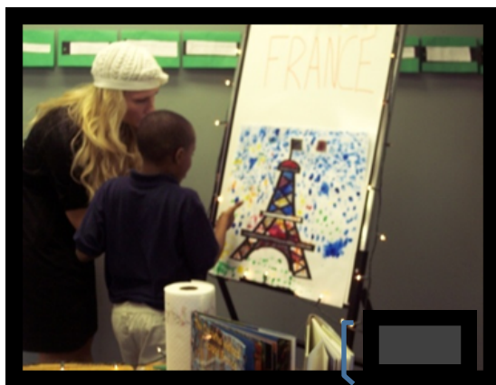
Figure 3: TC helps child create Pointillism of the Eiffel Tower

Five stations were created depicting the selected countries and distinctive cultural practices associated with them. These included France, China, Italy, Greece and Australia. Three other stations highlighted specific multicultural groups within the United States such as the Underground Railroad of the pre-Civil War period, the Haudenosaunee (Six Nations of the Iroquois), and the May Day tradition of Hawaiian children. At these stations, the arts were represented in a variety of ways. In France, for instance, the commercial art of fashion design was highlighted along with Seurat's fine art painting style of pointillism. The children and parents who visited this station ultimately created and/or observed the development of a painting using pointillism—albeit with finger paints.