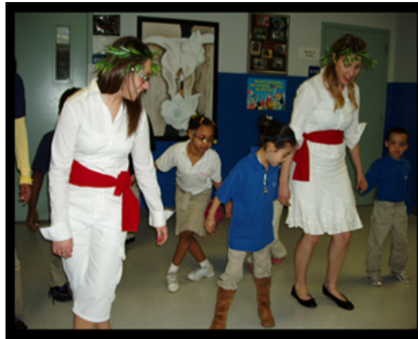
Figure 6: TCs teaching children the Zorba

Children learned about an historical culture when they participated in the creation of quilt squares depicting “secret” symbols thought to have been used by slaves on the Underground Railroad to gain their freedom in the North and Canada. Traveling to China, children were enraptured by a description of the practice of Chinese calligraphy and seeing their own name written in pictorial script. Scholars from the China Studies Center on campus assisted the TCs in this endeavor. On their visit to Italy, the participants went to the Carnival of Viareggio where they designed masks in the traditional style. And finally, their journey to the land-down- under gave the participants the opportunity to engage in a Readers’ Theatre presentation of a traditional Australian tale. Each of the stations featured a children’s book with the TCs employing a research-based strategy for presentation of the text and a snack representative of the culture portrayed. The following table displays the literature, instructional strategy, cultural food and activity presented by the TCs at each of the stations designed for the fair.