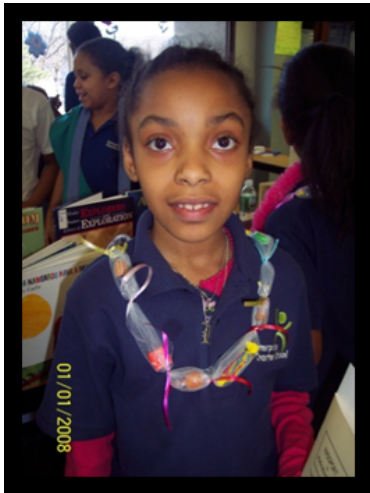
Figure 5: Child with completed kiki lei

The Greek station featured dance with TCs leading all of the visitors in dancing the Zorba. Representing a culture in our own United States, the Haudenosaunee station engaged families in the oral tradition of storytelling and creation of cornhusk no-face dolls while at the Hawaiian station children created Keiki Leis as do Hawaiian children on Lei Day (May Day).