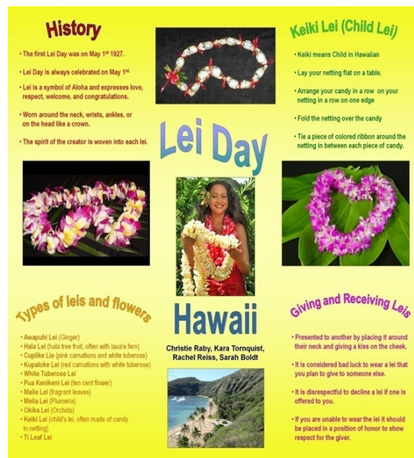
Figure 3. One of eight electronic posters created by Teacher Candidates