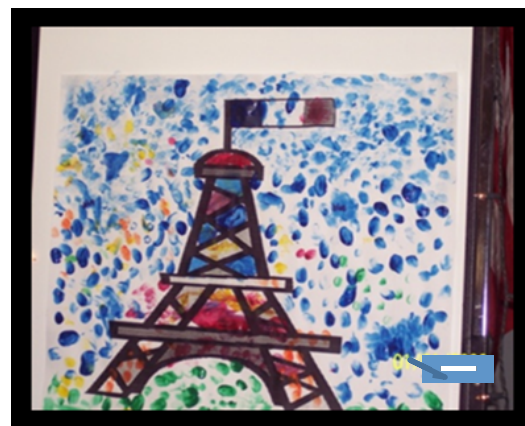
Figure 4: Finished painting using fingers for points of color