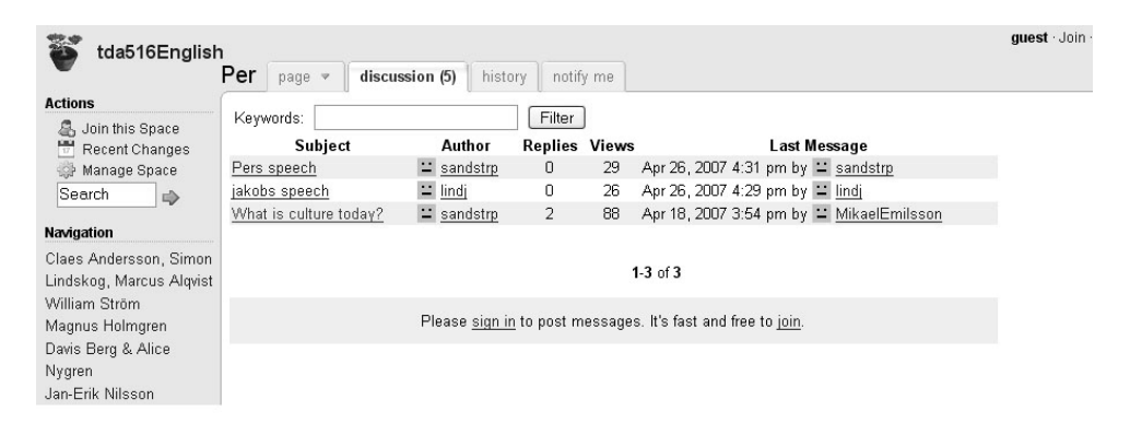
Figure 2. The start page of the discussion forum belonging to the same web page (Per)

The other area was the discussion forum belonging to each wiki page, where the postings are also listed in chronological order with potential replies under each subject. Apart from displaying the title, author and number of replies, number of views and date together with the last message are found on the discussion forum (see Figure 2).