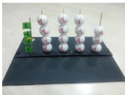
Figure 1: Example provided by Esra as a creative manipulative

Esra gave another creative activity example for group work—the manipulative—which was developed by the prospective teachers, and is displayed in Figure 1.