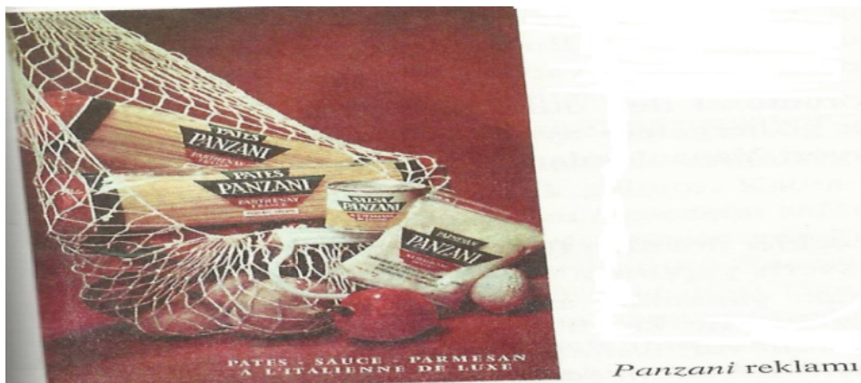
Figure 2. Advertisement of Panzani.

For Barthes, as is seen in the following photograph, the message of the advertisement is composed of three layers: linguistic message, unencrypted visual message, and encrypted visual message. The first message is composed of the labels and the script. The second layer, the unencrypted visual message, is composed of familiar things such as spaghetti packs, nets, tomatoes, etc. These two layers are in the sphere of literal meaning. However, the essential sphere that truly makes the advertisement is the layer of connotative meaning. Here Barthes distinguishes the signs and interprets the same with regard to cultural background (Akerson, 2005).