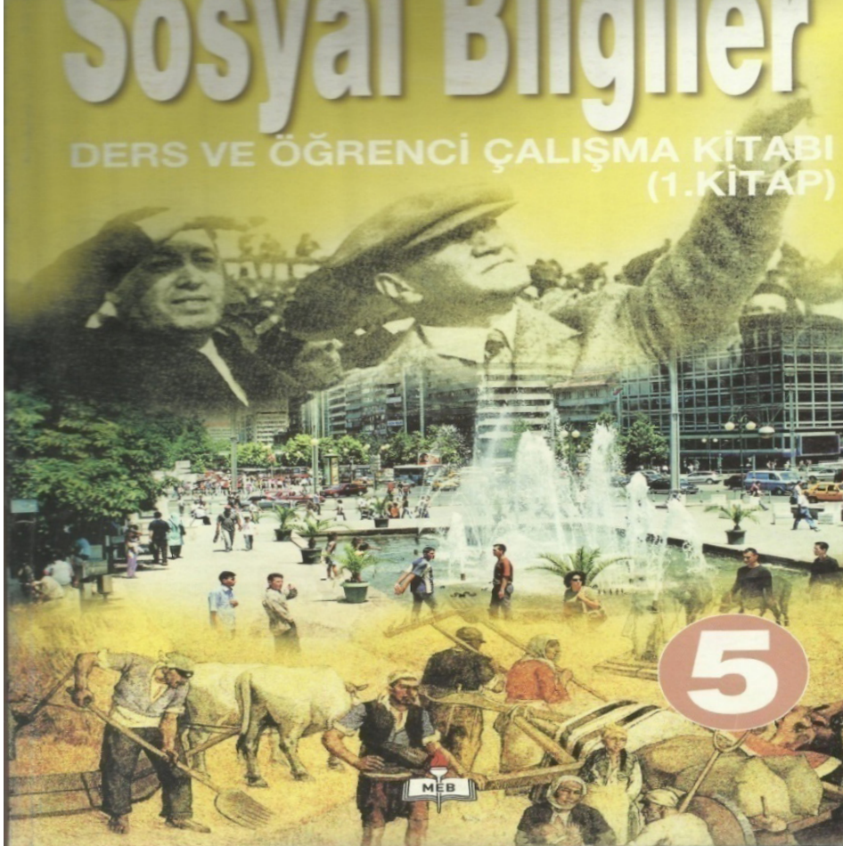
Figure 3. The cover photograph of the Social Sciences text book (Başol et al., 2011).

For the purpose herein, the following cover photograph from the Social Sciences textbook that was adopted by the MNE for use by 5 th graders in primary schools under the MNE during the 2011-2012 school year was taken into consideration.