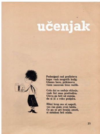
Image 1. Niko Grafenauer and Lidija Osterc: Pedenjped. Ljubljana: Mladinska knjiga, 1966, p. 23

Lidija Osterc 10 (Image 1, Pedenjped A) complemented the poem with an illustration of a boy with bushy hair, round glasses, shorts, striped socks and pointy little shoes. His shorts and socks resemble the fashion from the first half of the twentieth century. He is standing in an upright position, holding in his hand the book titled ABECEDA (Alphabet) which is turned upside down. There is no representation of space, and the illustration is placed right next to the text. The boy's head is facing the left side. Judging by his body proportions, we can assume that it is a schoolboy rather than a preschool child. The boy in the picture appears to be "reading" or viewing the book with interest, though the letters on the cover being turned upside down indicate that he cannot actually read. The drawing by Lidija Osterc is in black and white, printed on a toned paper. The title of the poem is white, while the text is black. The use of achromatic colours arouses the feeling of aloofness and seriousness. However, the illustration does not provide any information on what "jumble" (the phrase in the Slovenian language is 'hišni hrup' which literally means "domestic noise"; author's note) is supposed to be.