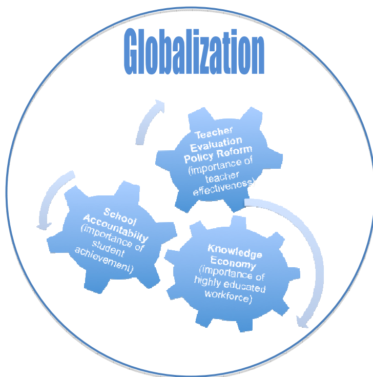
Figure 1. The knowledge economy, accountability, and teacher evaluation policy reform in the context of globalization