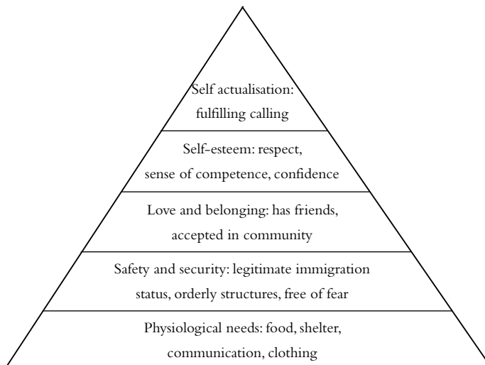
Figure 1: Maslow's hierarchy of needs (adapted from Lau, 1984, pp. 68–69)

Before arriving, international students needed admissions information, campus information and some contacts. They had questions about what to expect, what to bring, and where they would live. Most found admissions staff friendly and helpful.