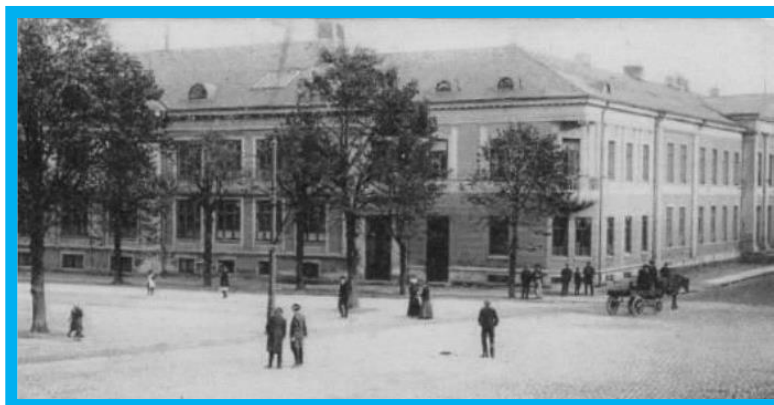
Figure 4. Drammen Latin School