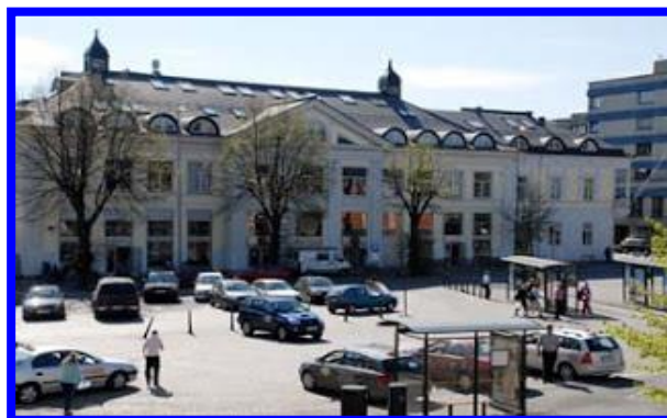
Figure 3. Drammen realskole – now a shopping center