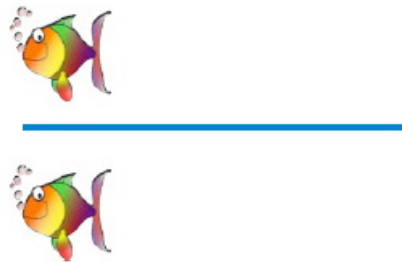
Figure 2. Below or above: which fish is below the line?

The post-test surveys used at the end of the school year were similar to pre-test surveys, with some additional facts about the narratives. The sample question (Figure 2) was: "Below or above: which fish is below the line?"